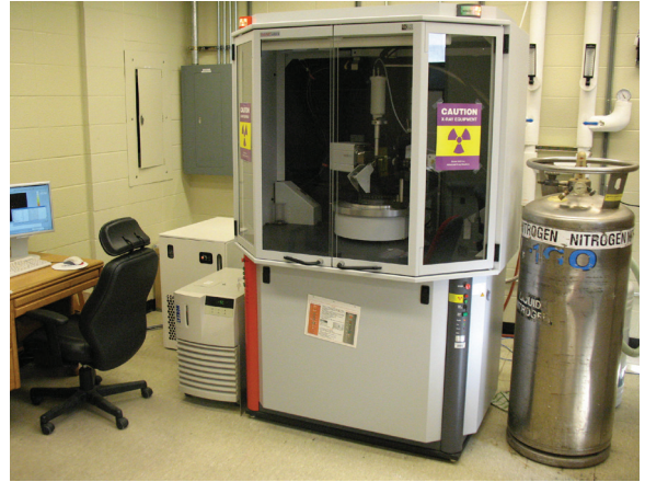
(Left) Radiation Warning Tape around Benchtop; (Right) Radiation Producing Machine